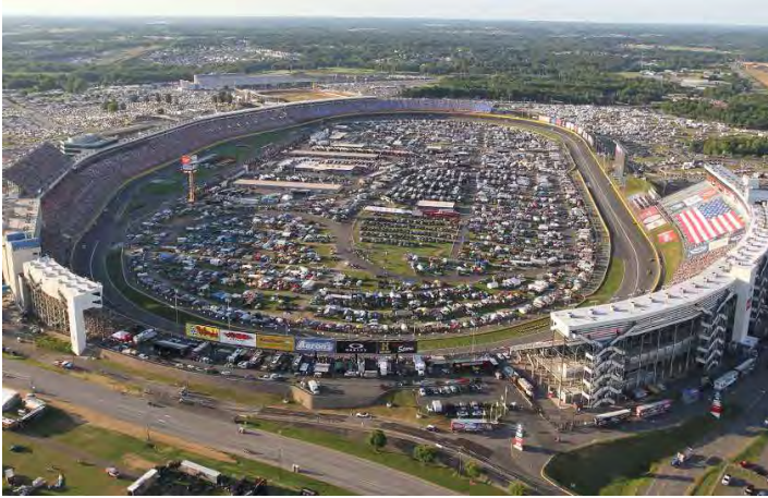
Charlotte Motor Speedway