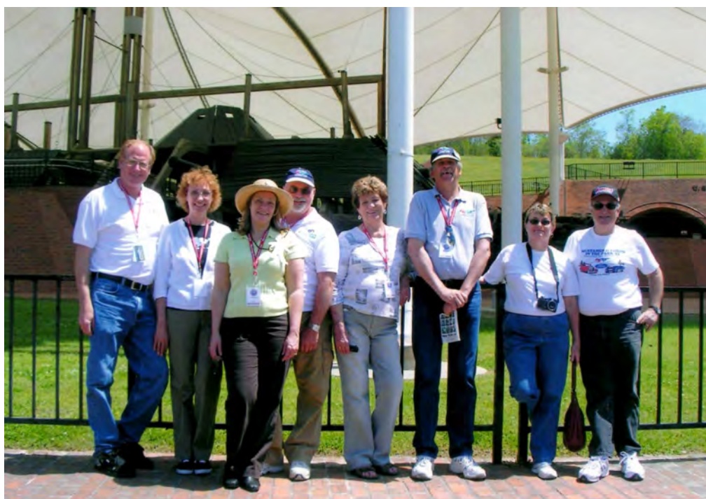
The Group Photo on the way to the 45th Anniversary in Birmingham in 2009