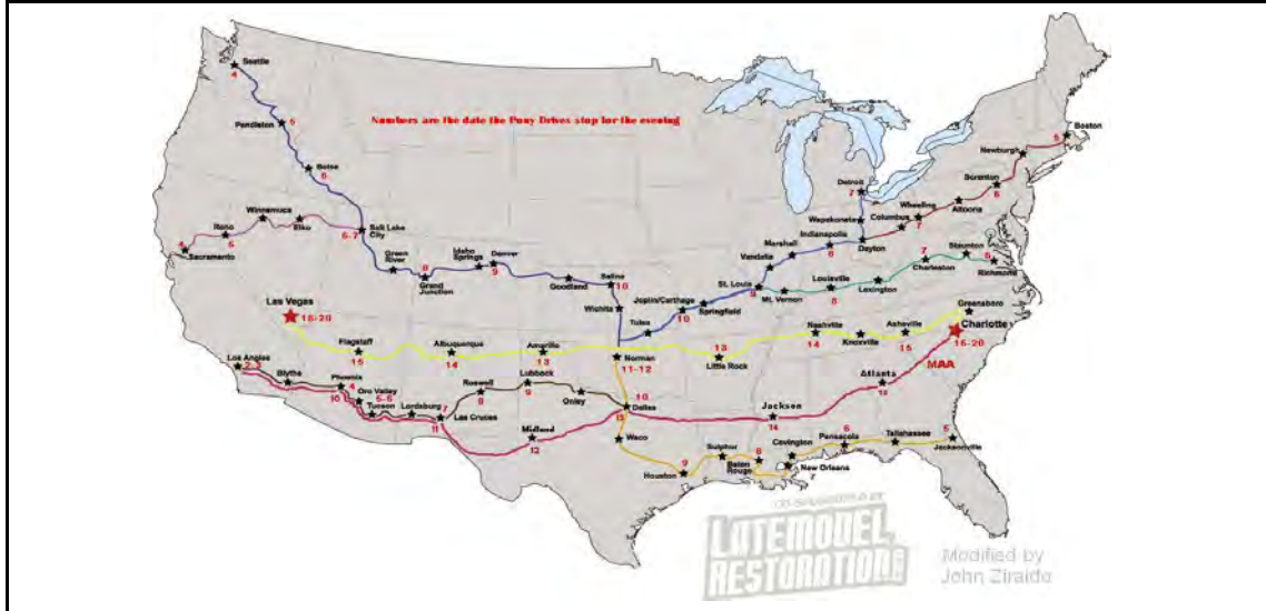
Map of the various Pony Drives

For more information about the 50th: http://www.mustang50thbirthdaycelebration.com/