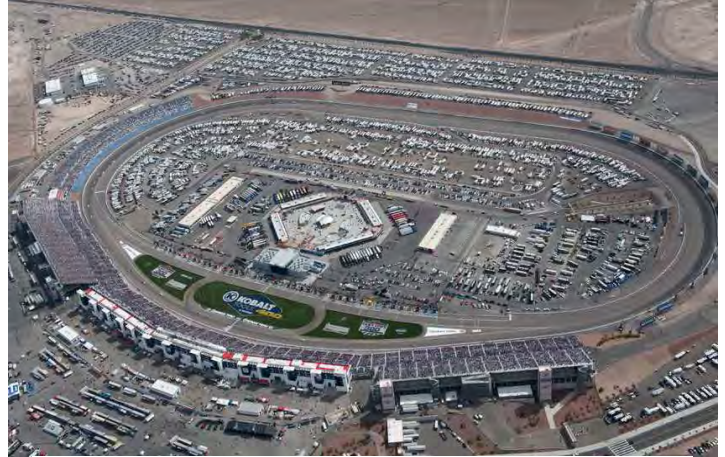
Las Vegas Motor Speedway